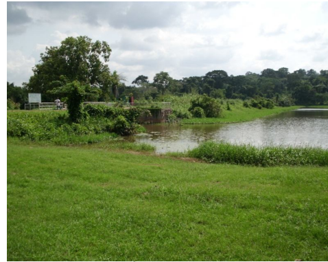
Fig. 4: The IITA Spillway and Dam Embankment after the Flood (7 th September 2011)