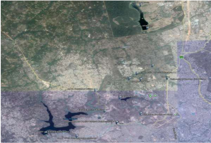
Fig. 2: The three Reservoirs within Study Area.