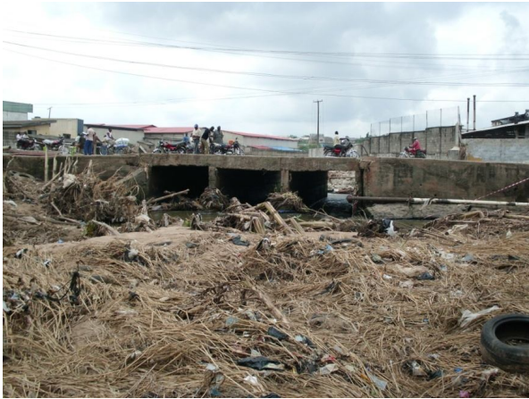
Fig. 3: Solid Waste Blockage at The Culvert Entrance at Oluyole Estate

Solid waste collection and disposal system in the City are poorly managed. According to Onibokun & Kumuyi 1999, Sangodoyin 1991, Olaseha & Sridhar 2004, Adenji & Ogundiji 2009, and Olaseha, I. O. and Sridhar, M. K. C. (2004 ) that the solid waste management service in Ibadan are inadequate, with a preponderant proportion of the refuse generated remaining uncollected and with large parts of the city, particularly the low-income areas, receiving little or no attention. The wastes are generally disposed in the storm drainage and river channels, constituting major friction to flow of stormwater in the channel and become trapped at bridges and culvert locations causing over spilling of flood waters at such locations. Figure 3 shows a typical solid waste problem at Oluyole Estate Ibadan.