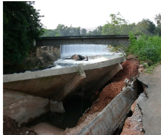
Fig. 6: The IITA Spillway and Dam Embankment after the Flood (7 th September, 2011)