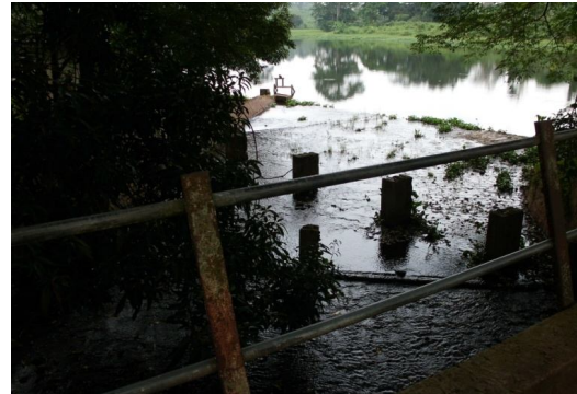
Fig. 5: The UI Dam Embankment and Spillway after the flood 6 th September 2011