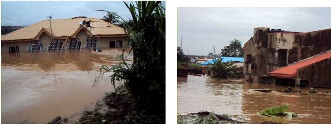
Fig. 7: Some cases of Property Submergence during the Flood

Garage, other place. Heap of garbage were seen deposited at the entrances of most of the bridges and culverts indicating that their capacities have been overwhelmed. Road pavements and the coal tar were peeled up and transported downstream thereby causing serious traffic disruptions. The Oluyole Power Holding Company of Nigeria (PHCN) substation, the fish ponds belonging to the Fisheries Department University of Ibadan, several residential houses were damaged and over 100 human lives were lost during the flood disaster. Figure 7 shows some of the properties damaged by the flood.