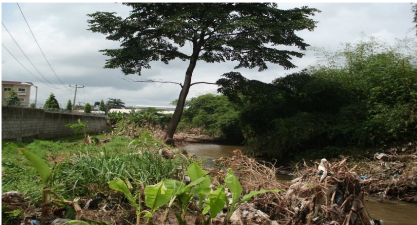
Fig. 2: Ona River Channel at Oluyole Estate Ibadan

A physical assessment of the upper reach of the river shows a significant part of the flood plain and the river channel has been encroached by housing, commercial and industrial developments. The Channel bed is characteristically flat in most reaches having lost its depth to siltation arising from silts, debris and solid wastes it carries in its flow. The hydraulic implication of this is the loss of river channel's runoff carrying capacity. Of great concern is the presence of thick vegetation comprising of bamboos, typha and elephant grasses and big trees along the river channel as it flows through the City. This help in trapping debris and volume of solid waste in the runoff thereby creating high frictional flow with attendant high time of concentration. In the event of high rainfall like the one experienced on August 26, 2011, the channel capacity easily become overwhelmed resulting in the flooding of its floodplain and adjoining properties. Figure 2 presents the situation of the Ona River Channel at Oluyole Estate.