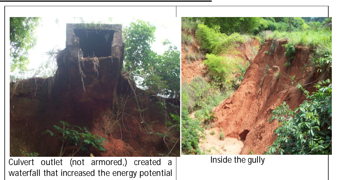
of the channel concentrated flow. Figure 5: Ogberuru gully formed by drainage

Special Publication of the Nigerian Association of Hydrological Sciences, 2012