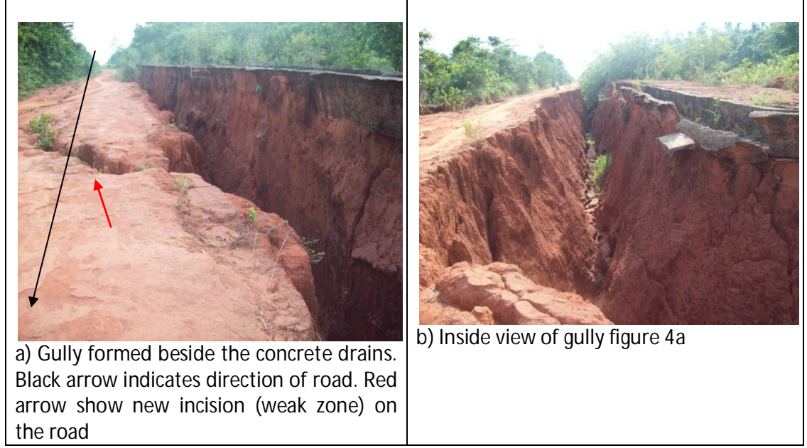
Figure 4: Ikeduru gully

that, at the design stage, the effective runoff for this watershed vis-à-vis the slope was not considered.