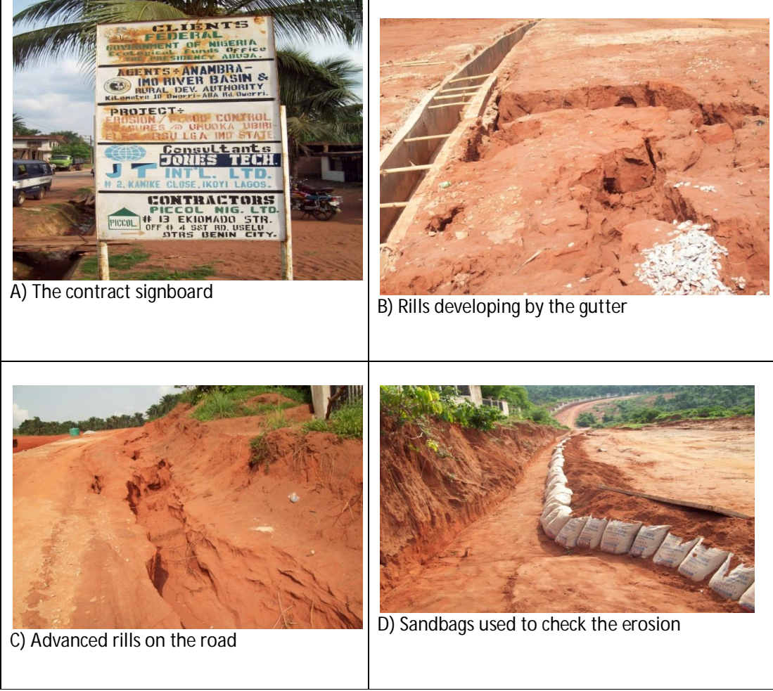
Figure 3: Umuoka Ubiri Elem erosion site

The gully in this site was mechanically bulldozed and flattened out down to the Azezie Asa river. Due to poor work done in terms of soil compaction and defective concrete channel (drainage length - 900m, depth - 1m, width-1m, thickness of concrete - 0.15m, no rip-rap, no groin, no armoury, no detention) rills have begun to develop measuring up to700 m in length and 1.4 m in depth. Current effort at checking this erosion is the use of sandbags (Figure 3). The power of surface runoff was completely disregarded in this site. In no time, if urgent efforts are not put in place to control the surface runoff, the gully may resurface.