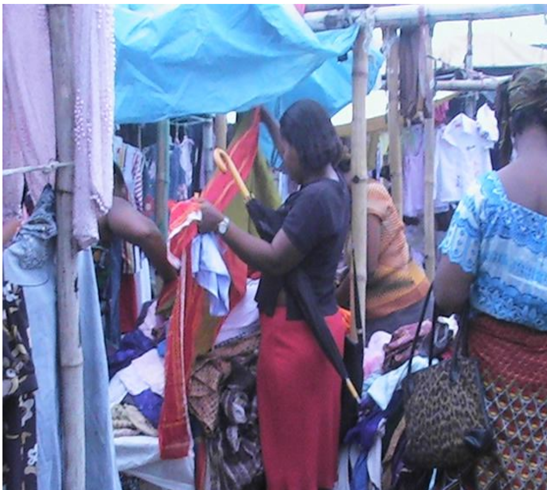
Plate 1: Consumers selecting clothes in a second hand market.

helping consumers gain the skills, right attitudes and knowledge they need to be able to gear the choices they make as consumers to their economic interest and to protect their health and safety" (Brennan and Ritters, 2004).