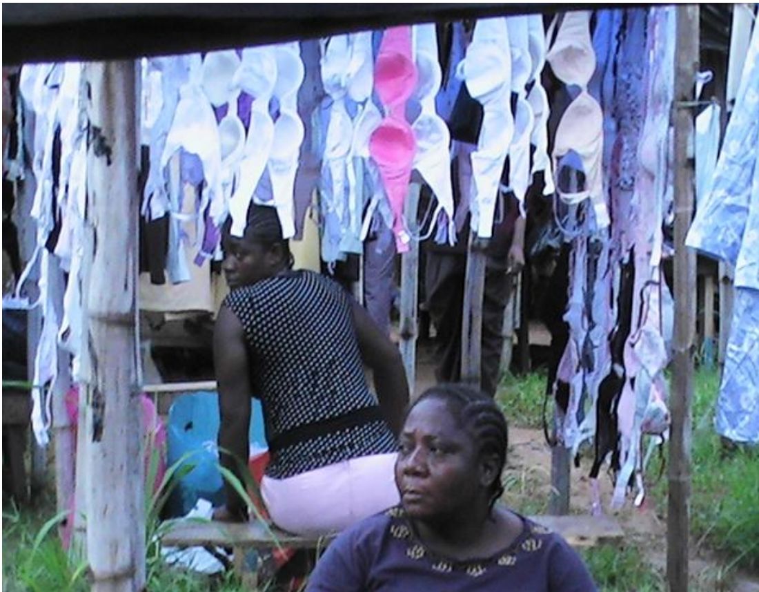
Plate 2: Non-sterilized used bra on display at Second Hand Market.