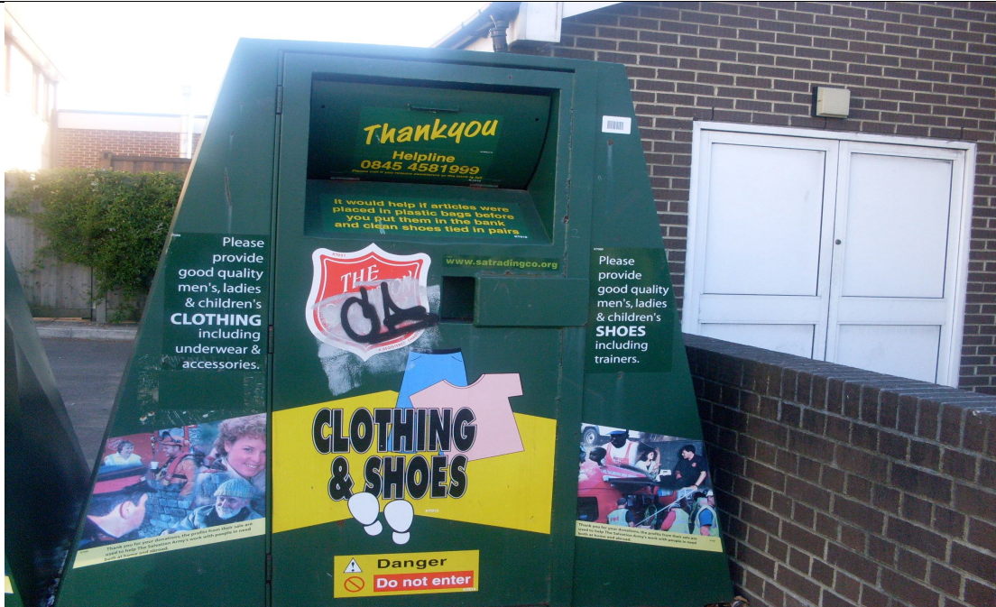
Plate 3: Photograph of a collection centre for second hand clothing items in Southampton, England